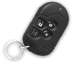
图 1. MCT-234